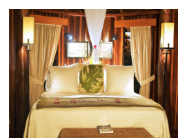
Garden Tropical bure