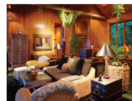
Dream House living room