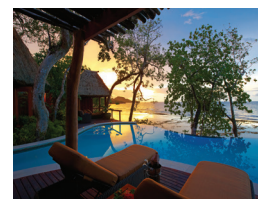
Villa private pool